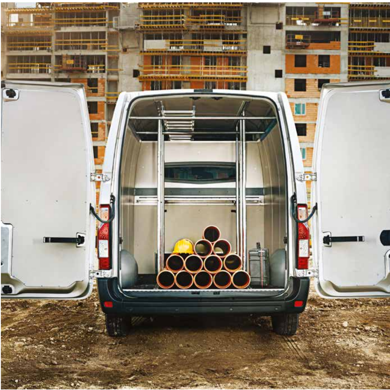
Interior fitting for illustrative purpose

The diversity of the Master range brings you an exceptional range of possibilities of panel vans and chassis cab.Renault Master is available in both front and rear wheel drive versions, with single or twin wheels when the load carried or road surface requires greater traction. Available in three lengths and three heights, Renault Master brings you a choice of load volume: from 8 m³ to 17 m³.