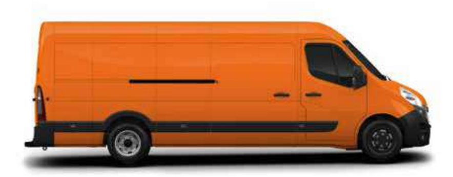
Rear-wheel drive panel van