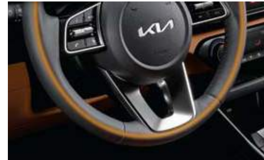
Heated steering wheel