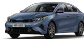
Horizon Blue (BBL)