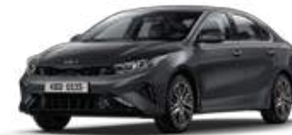
Platinum Graphite (ABT)