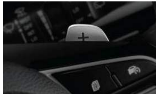
Paddle shift levers