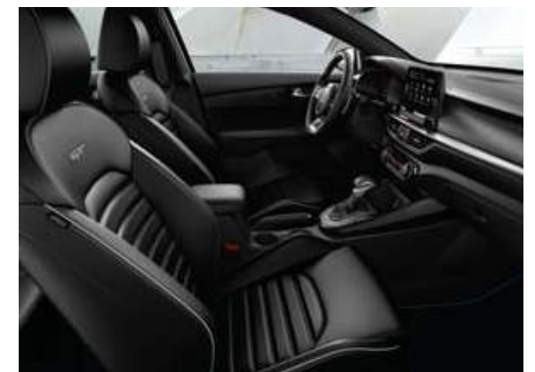
GT-Line _ Black Leather