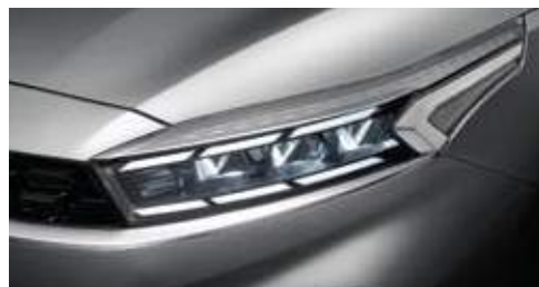
Full LED headlamps