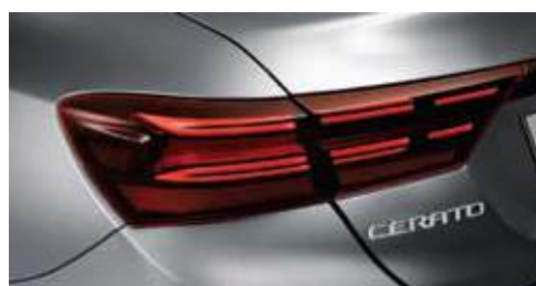
LED rear lamps