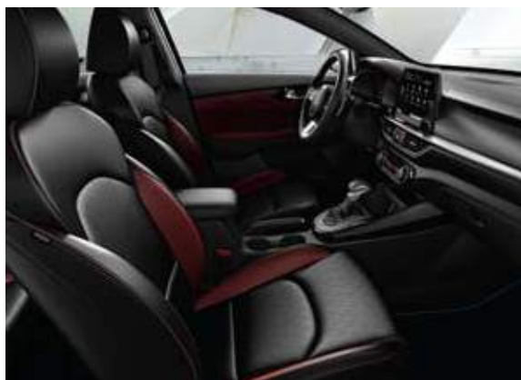
Red Color Package _ Black & Red Leather