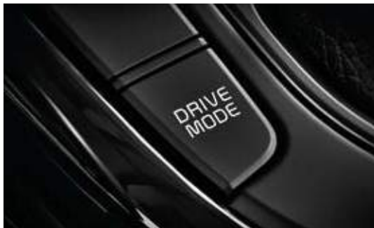
Drive mode select