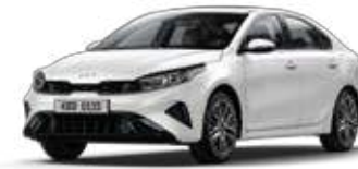
Snow White Pearl (SWP)