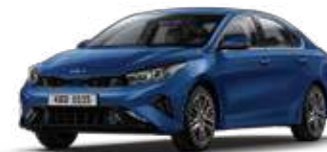
Mineral Blue (M4B)