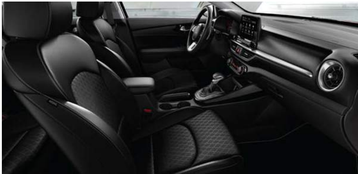
EX _ Black Leather

Choose from soft, durable seating options, available in attractive cloth or cloth-and-leather combinations. Each choice is designed to complement the contours and trim details of the Cerato's interior, creating an inviting and relaxing cabin environment.