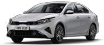
Silky Silver (4SS)