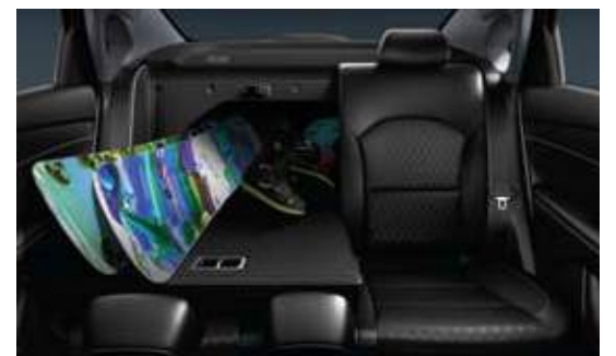
60:40 split folding seats