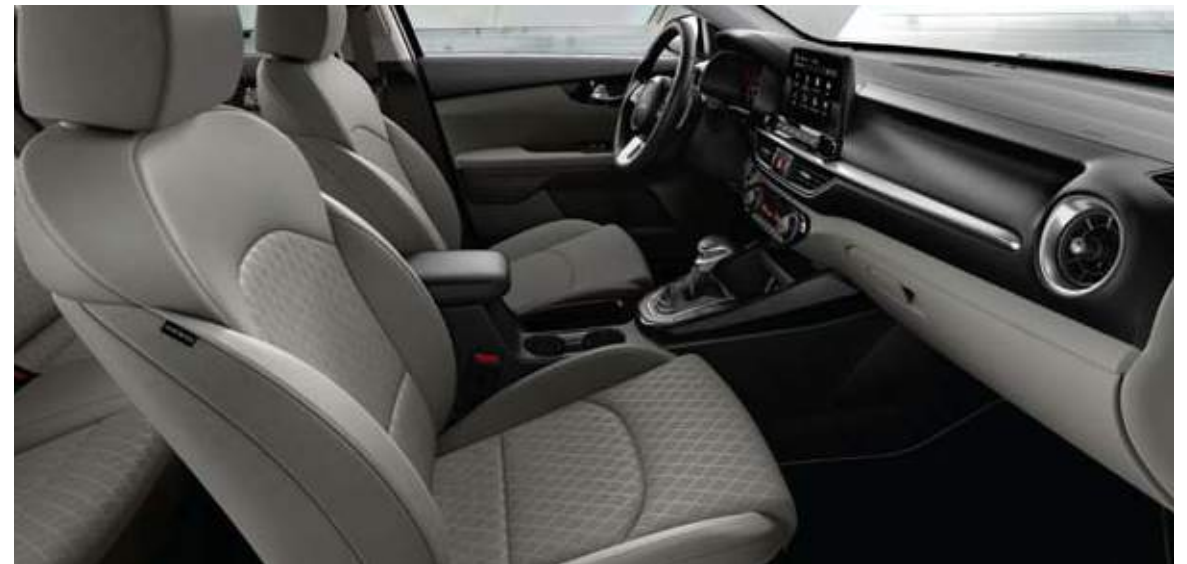
EX _ Gray Leather