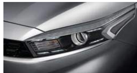
Bulb headlamps with LED DRLs