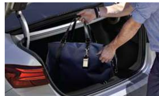
502ℓ cargo capacity