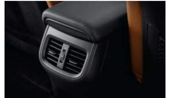
Ventilation for 2nd row passengers