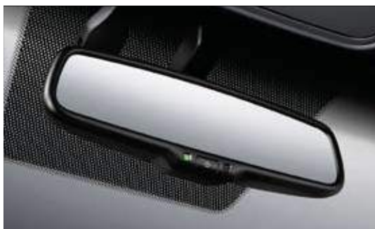
Electrochromic rear view mirror