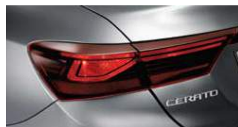
Bulb rear lamps