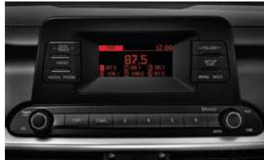
3.8-inch compact audio