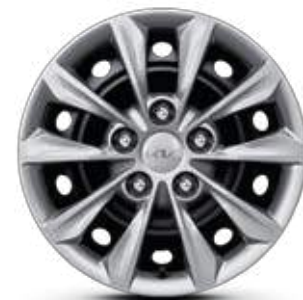
15-inch 195/65 R15 Steel Wheel (wheel cover)