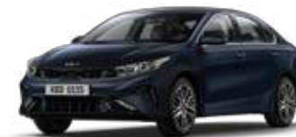
Gravity Blue (B4U)