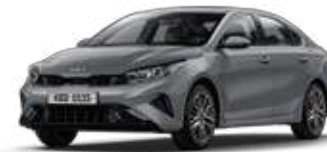
Steel Gray (KLG)