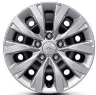
16-inch 205/55 R16 Steel Wheel (wheel cover)