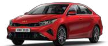
Runway Red (CR5)