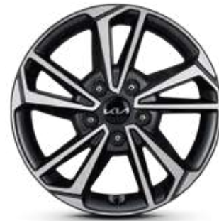
16-inch 205/55 R16 Alloy Wheel_Dark Metal Gray