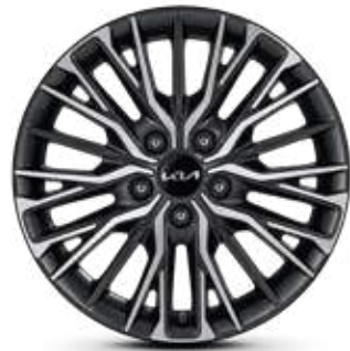
17-inch 225/45 R17 Alloy Wheel_Dark Metal Gray