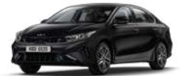
Aurora Black Pearl (ABP)