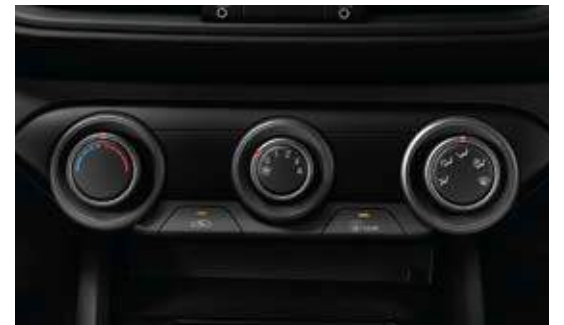
Manual temperature control