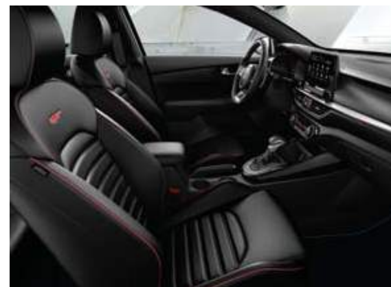
GT _ Black Leather