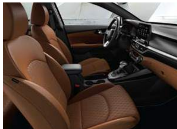
Brown Color Package _ Brown Leather