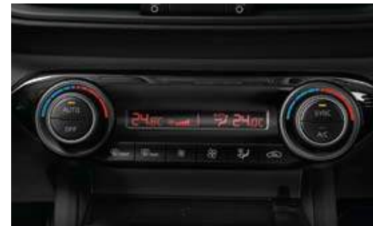
Dual-zone full auto temperature control