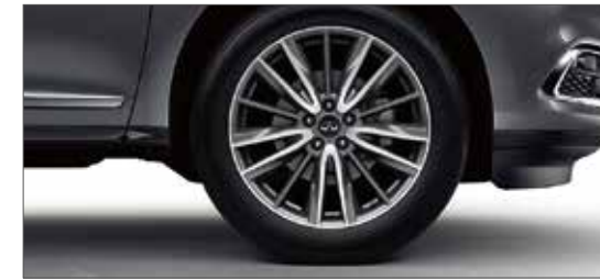
20 X 7.5-INCH 15-SPOKE ALUMINUM-ALLOY WHEELS